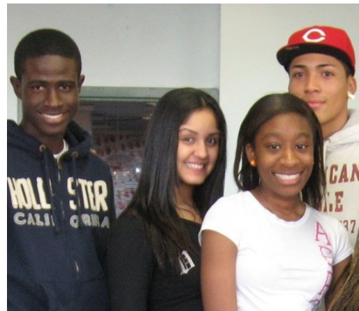
Members of Leaders in Conflict Resolution and students on the Bushwick Campus participate in conflict resolution workshops.

The program emerged because Bushwick students expressed interest in taking more responsibility for keeping peace and promoting unity on campus. They recognize how conflict impacts their day-to-day lives, including their relationships, learning, future paths, and their schools' reputation in the community. By developing unity and new skills across the campus' three separate school cultures—and among students and adults of diverse backgrounds—a conflict resolution program has the potential to encourage a positive learning environment and a sustainable culture of respect and non-violence.