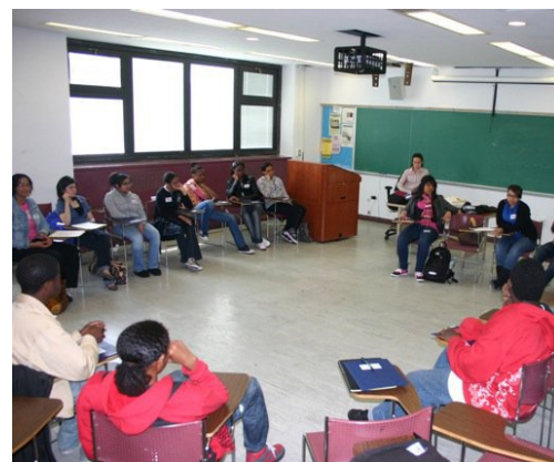
Student Leaders in Conflict Resolution hold a workshop at the Brooklyn College East New York Youth Summit.

Punitive and exclusionary discipline practices, such as excessive suspensions and police tactics, fail to prevent or reduce conflict, have negative impacts on student engagement and academic outcomes, and push young people out of school. 1 The schools featured in this case study series use positive practices proven to reduce conflict and improve learning. School systems should adopt these practices to ensure students' human rights to: