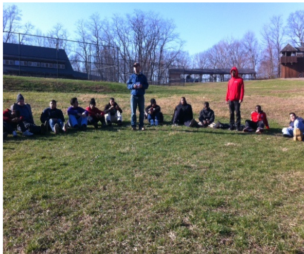
Students and staff from Lyons Community School meet in a restorative circle at their retreat.