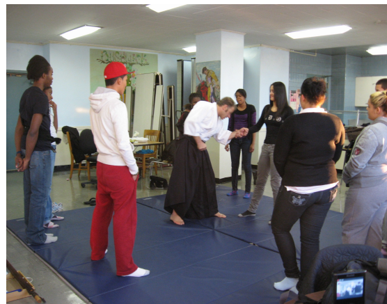
Leaders in Conflict Resolution participate in an Aikido in the Schools session.