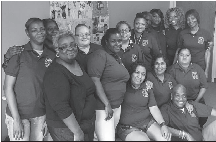
Parents and grandparents are getting involved in so many ways! You, too, can make a difference. Participate in your local school and work with other parents and the school staff to make restorative justice come to life.

“Restorative justice gives students opportunities to express themselves and to talk about why they did what they did, and to learn from it. We provide an alternative to suspension or detention and now the number of suspensions is on its way down. In the circles, the students get to know each other at a deeper level. Considering how many areas feed into our school now, it is so important that we build respect across different neighborhoods or backgrounds.”