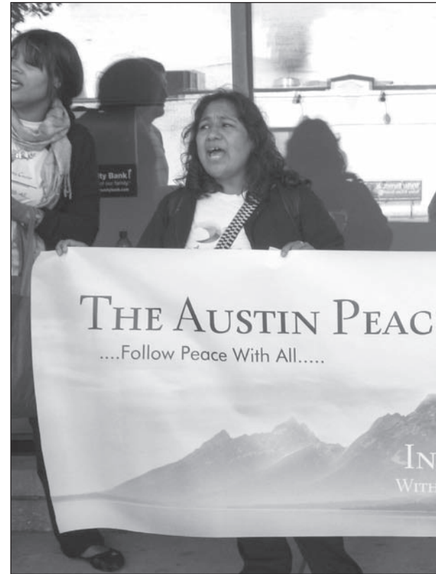
As parents and grandparents work together, families, schools and communities grow stronger.

“When children are suspended or expelled, they often are put out on the streets—in more danger than whatever trouble they were into at school. Alternatives to suspension can be about teaching our children responsibility and de-escalating the trouble.”