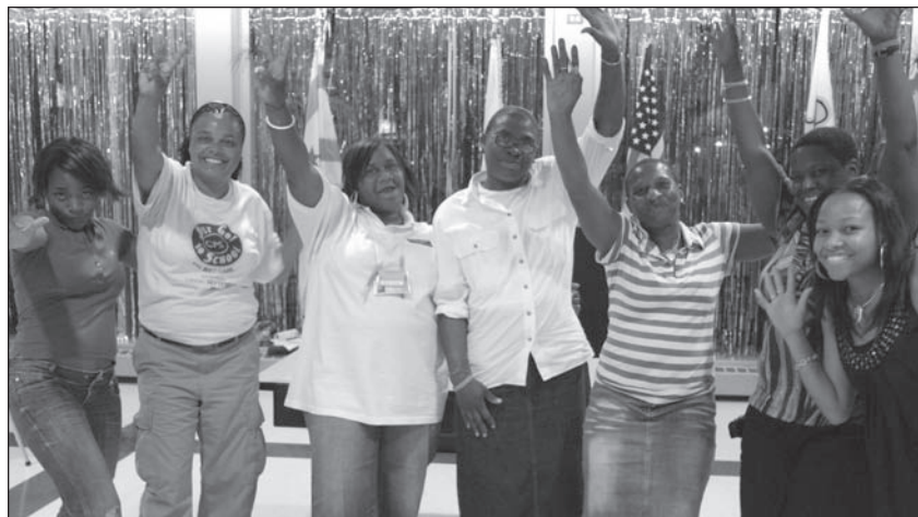
Celebrating the power of parents!