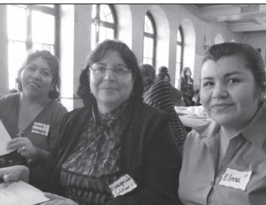
POWER-PAC leaders talked with hundreds of parents across Chicago.

We recommended the following changes in discipline policies in Chicago Public Schools. While we are still working together to achieve more, some of these recommendations are already becoming reality!