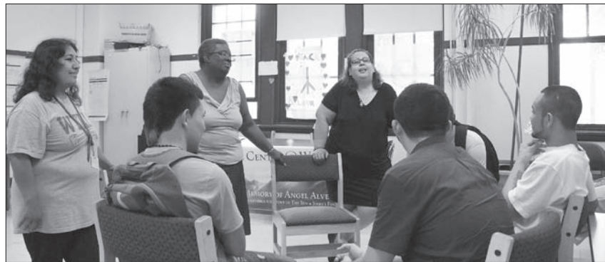
At a Parent Peace Center

The program proved successful beyond the parents’ dreams. An evaluation through an examination of grade reports, teacher check-ins, and attendance records found that 80% of the participating students showed improvements academically and the teachers reported significant changes in their behavior and attitude.