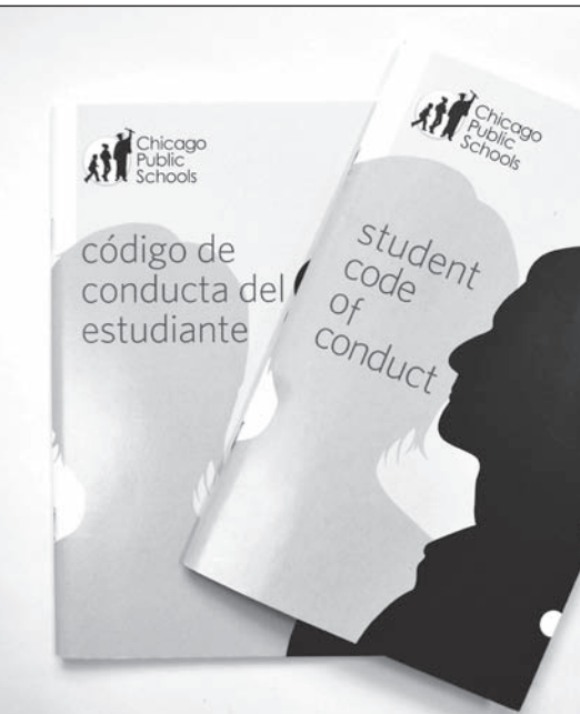
Parents can read about school discipline policies, including new restorative justice options, in the CPS Student Code of Conduct.

Since parents won changes in the Chicago Student Code of Conduct in 2007, the code now is based in a philosophy of Restorative Justice . According to CPS, “Restorative Justice is an approach to conflict that focuses on repairing harm and creating space for open communication, relationship building, healing and understanding....it is a way for those impacted by conflict to be a part of finding solutions that meet their needs and promote community safety and well-being. In a school setting, Restorative Justice Practices can help students develop the critical thinking and social skills they need to be successful throughout the school community.”