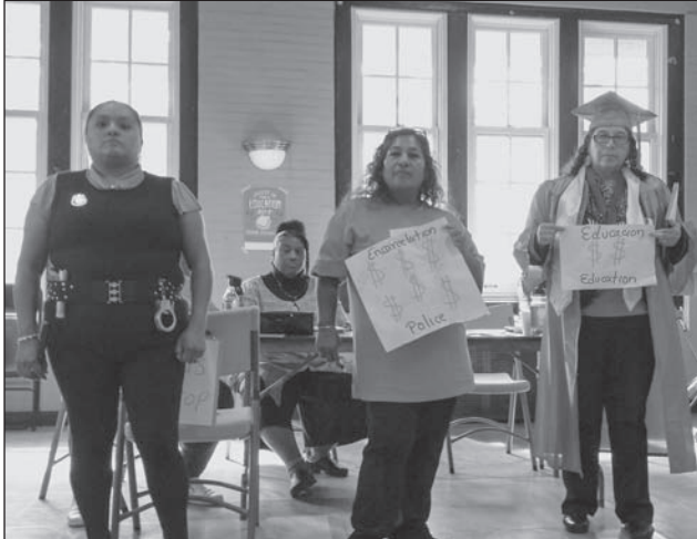
Parents engage in a street theater skit to make the point that shifting dollars from policing in schools to restorative justice and other prevention programs is a good investment in students’ long term educational success.

By the end of the Peace Circle, the two agreed to speak more respectfully to one another and to spend time together. The student was not suspended or arrested. Instead, he had found someone to listen to him and to be there for him. Both parties involved had learned a lesson about themselves and about each other.