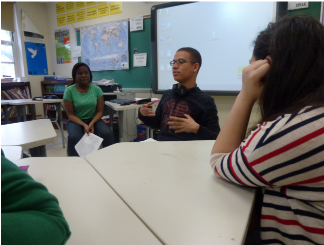
Student leaders at the Bushwick Campus give a workshop in conflict resolution to fellow students.

After the Student Leaders in Conflict Resolution program had built greater awareness and support for positive ways of responding to conflict on campus, the Restorative Justice Committees formed and began exploring different positive approaches to school discipline. Over the past two years, these committees have supported the four small schools on campus in establishing restorative school norms, justice circles and peer mediation, with each school taking its own particular approach to implementing positive school discipline.