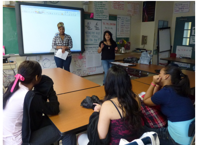
Student leaders at the Bushwick Campus give a workshop in conflict resolution to fellow students.