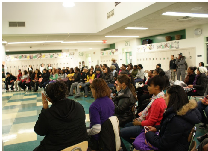
A town hall meeting at Validus Preparatory Academy.

Developed by educators at Humanities Preparatory High School in the 1990s, a Fairness Committee is a small group of students and adults, representative of the school community, who work to discuss violations of the school’s disciplinary policies and values with anyone who violates a policy or core value.