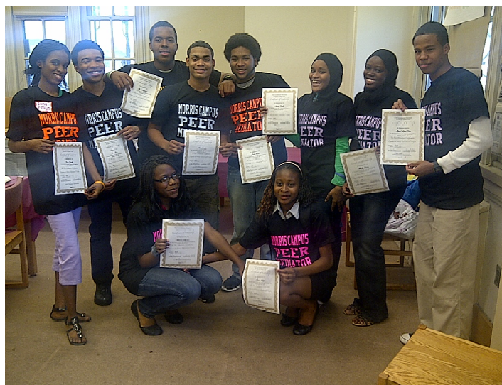
Students at Morris Campus complete their peer mediation training.

At the start of the following school year, school staff and community-based partners launched the Morris Campus Restorative Justice Project, which took on peer mediation training for students and restorative practices training for staff as their first initiatives to bring all four schools together. The peer mediation program began with weekly after-school trainings by The Leadership Program for roughly thirty students from the four schools on campus, which marked the first non-athletic collaboration between students from the different schools. The students who were trained as mediators formed the Morris Student Leadership Council with support from Sistas and Brothas United and Mass Transit Safety with Dignity. The goal of the Student Leadership Council was to plan out the implementation and promotion of the peer mediation programs in the respective schools and engage in broader discussions about school safety and restorative justice.